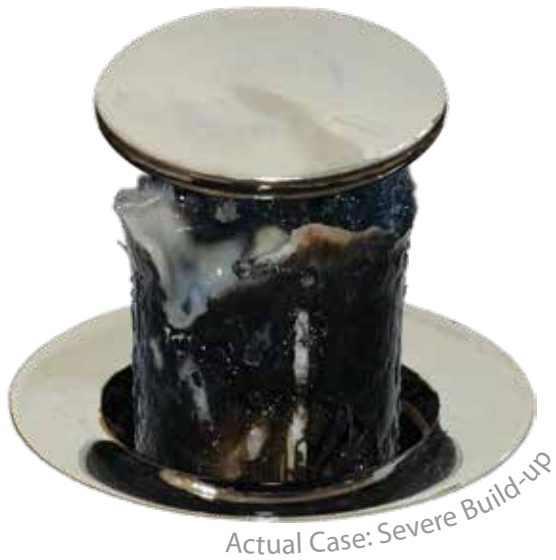
Actual Case: Severe Build-up